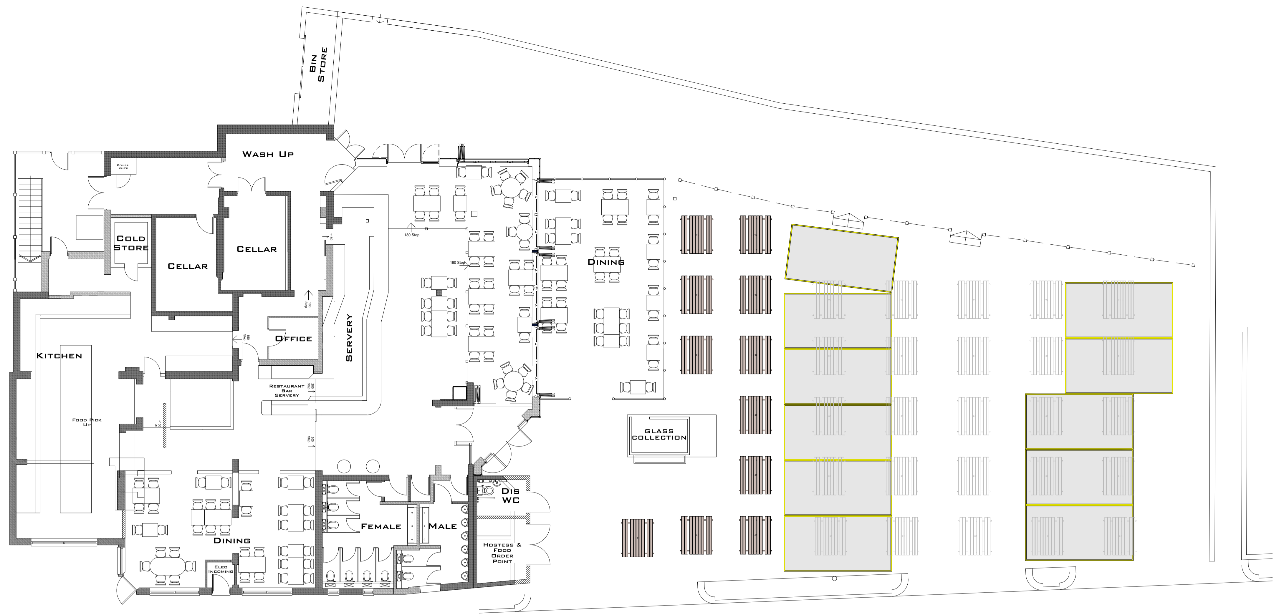
PROPOSED SITE PLAN SHOWING GLASS COLLECTION STATION

The contractor is to check and verify all building and site dimensions, levels, and sewer invert levels at connection points before work starts. This drawing must be read with and checked against any structural or other specialist drawings provided. The contractor is to comply in all respects with the current Building Regulations whether or not specifically stated on these drawings. This drawing is not intended to show details of foundations or ground conditions. Each area of ground relied upon to support the structure depicted must be investigated by the contractor and suitable methods of foundations provided. This drawing is to be read in conjunction with all other standard STONE MEI DESIGN LTD specifications and documentation. This drawing remains the copyright of STONE MEI DESIGN LTD and cannot be reproduced without prior permission. STONE MEI DESIGN LTD reserves the right to withdraw any drawings from any applications or third parties should disputes arise between the client and STONE MEI DESIGN LTD.